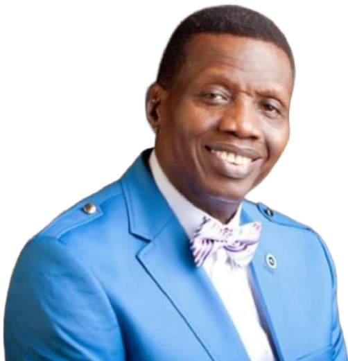
PASTOR E.A ADEBOYE GENERAL OVERSEER, RCCG WORLDWIDE