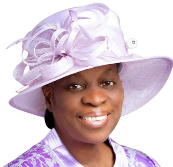
PASTOR (MRS) FOLU. ADEBOYE MOTHER IN ISRAEL, ,RCCG WORLDWIDE